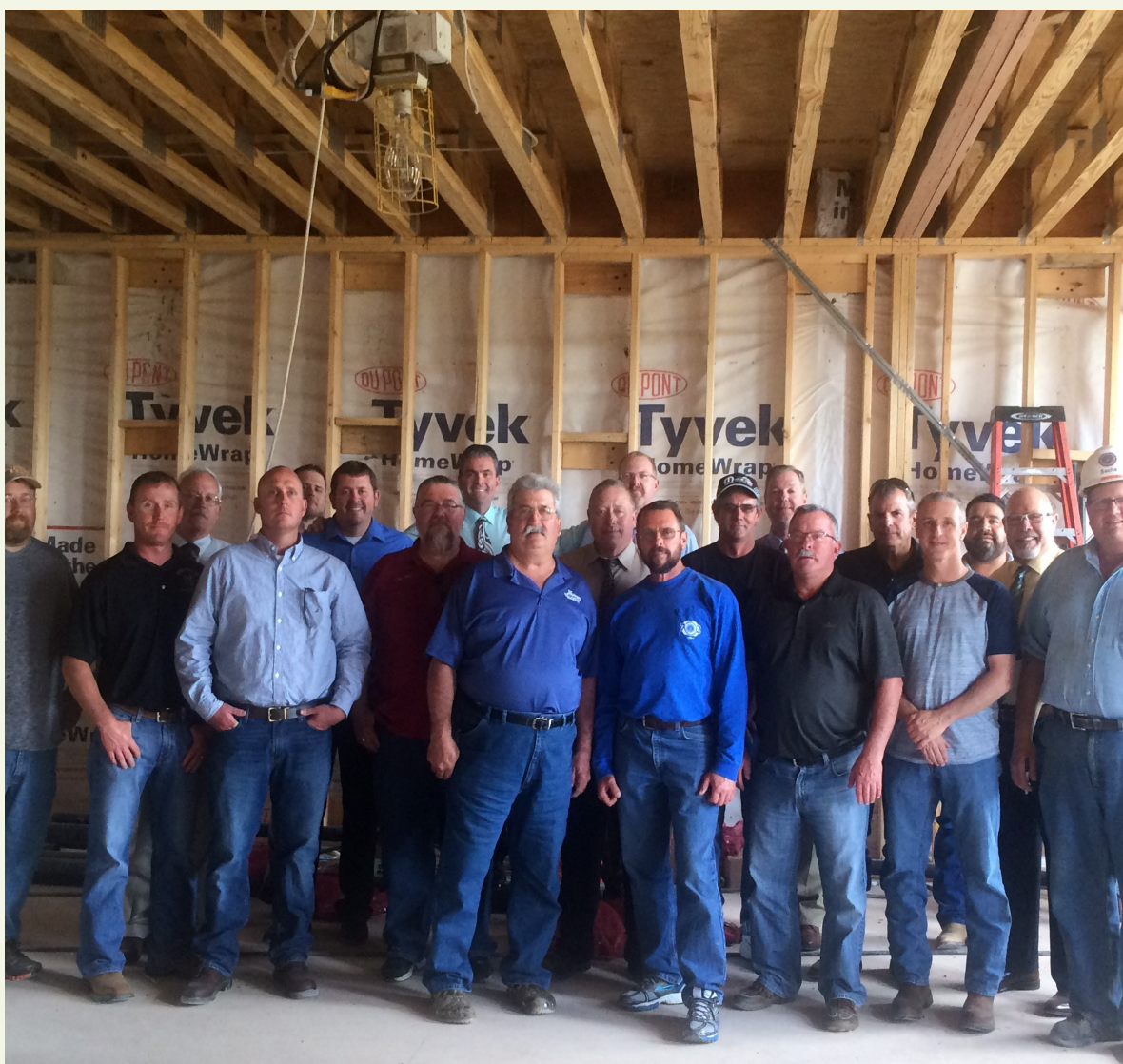
Local 702 Executive Board Members and Staff at the Henry Miller Museum in St. Louis, MO on April 22nd, 2016.